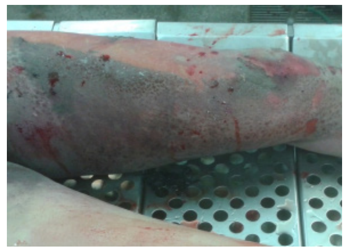
Figure 2: Circular lesions on thighs described in literatures as crocodile skin appearance

Besides routinely observed burn injuries and few abrasions, contusions and superficial lacerations, well patterned multiple circular lesions were present over the torso, both arms and over left lower limb, each ranging from 0.5 cm to 1 cm in diameter. The lesions presented with thick and hard irregular margins with singeing of hair around them, which best explained "crocodile skin appearance" as found in literatures (Figure 2 and 3) [1,2].